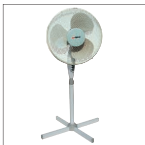
Ventilator cu picior EUR 11.00 Cod 025.010.500.020