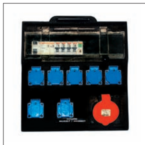
Panou Electric 380V/220V EUR 120.00 Cod 019.010.265.000