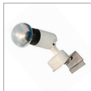
Lampa spot SS30 100W EUR 18.00 Cod 019.010.200.008