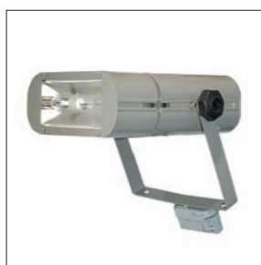
Reflector IVEN HQI 150W EUR 45.00 Cod 019.010.200.005