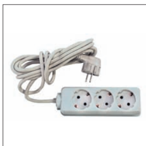
Prelungitor 230V, 10A, 3m EUR 12.00 Cod 019.010.277.000