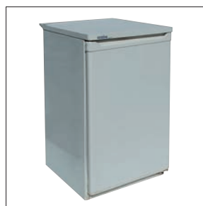
Frigider ARCTIC (180 l) EUR 54.00 Cod 025 010 070 020