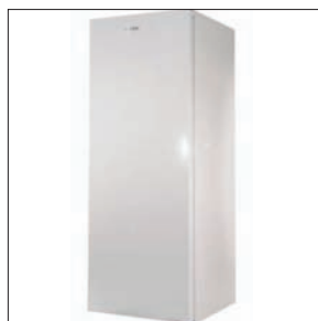
Frigider ARCTIC 255 l EUR 65.00 Cod 025 010 020 199