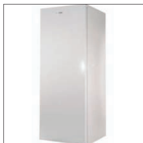
Frigider ARCTIC 255 I EUR 60.00 Cod 025 010 020 199