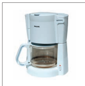
Filtru de cafea EUR 8.00 Cod 025.010.120.010