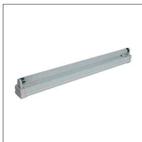
Corp fluorescent tip SS30 EUR 24.00 cu un tub D-170 - A Cod 019.010.190.001