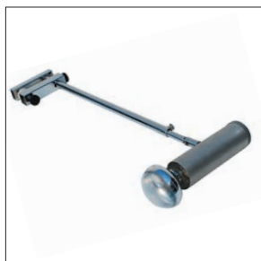
Lampa spot cu brat 100W EUR 15.00 Cod 019.010.181.000