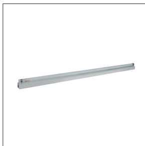
Lampa fluorescenta FIA EUR 21.00 cu instalatie electrica completa 1x40W Cod 019.010.110.000