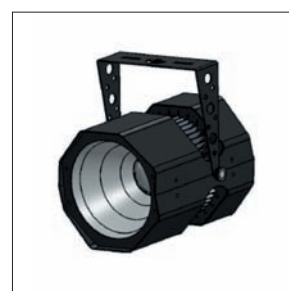
Reflector LED VIRGO 40W 4350 LM 4100 K EUR 50.00 Cod 019.010.200.045