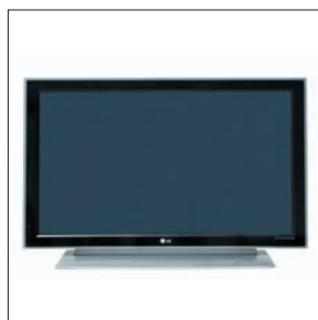
TV Plasma EUR 31.00/zi (diagonala ecran: 107 cm) Cod 025 010 130 040