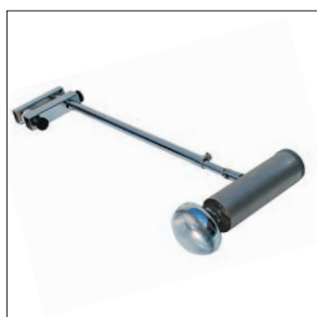
Lampa spot cu brat 100W EUR 18.00 Cod 019.010.181.000