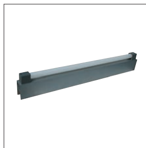
Corp fluorescent tip SS30 EUR 21.00 cu un tub D-170 Cod 019.010.190.000