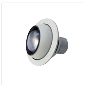
Lampa spot 100W EUR 18.00 Cod 019.010.170.000