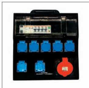
Panou Electric 380V/220V EUR 110.00 Cod 019.010.265.000