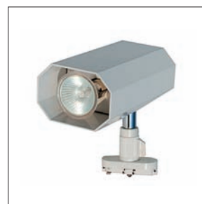
Spot halogen SY STAR 50W(A) EUR 18.00 Cod 019.010.186.000