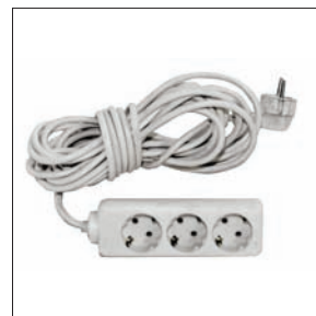
Prelungitor 230V, 10A, 5m EUR 12.00 Cod 019.010.279.000