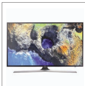
TV SAMSUNG UHD, EUR 65.00/zi (diagonala ecran: 163 cm) Cod 025 010 130 047