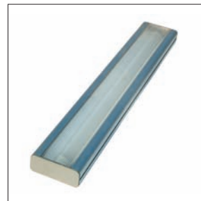
Corp fluorescent tip EUR 21.00 SYMA STAR Cod 019.010.200.001