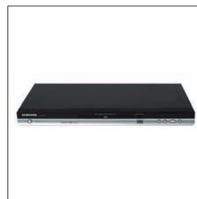
DVD Player EUR 50.00 Cod 025 010 130 030