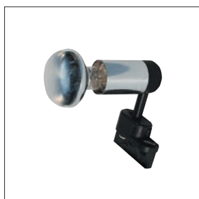
Lampa spot 100W EUR 18.00 Cod 019.010.188.000