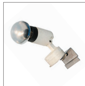
Lampa spot SS30 100W EUR 15.00 Cod 019.010.200.008