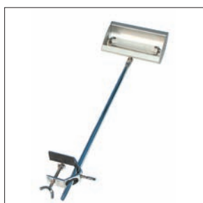
Reflector cu brat 300W EUR 45.00 Cod 019.010.200.010