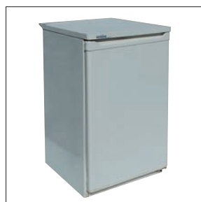
Frigider ARCTIC (180 l) EUR 49.00 Cod 025 010 070 020