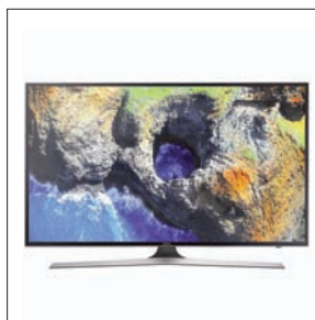
TV SAMSUNG UHD, EUR 75.00/zi (diagonala ecran: 163 cm) Cod 025 010 130 047