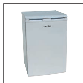
Racitor (140 l) EUR 28.00 Cod 025 010 070 010 (55 x 61 x 84 cm)