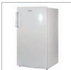
Frigider ARCTIC FB 155 EUR 28.00 Cod 025 010 020 198