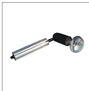
Lampa spot stut OCTANORM EUR 15.00 Cod 019.010.187.000