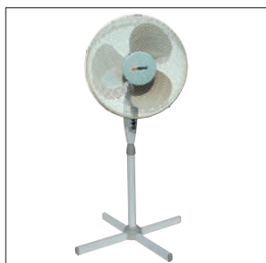
Ventilator cu picior EUR 9.00 Cod 025.010.500.020