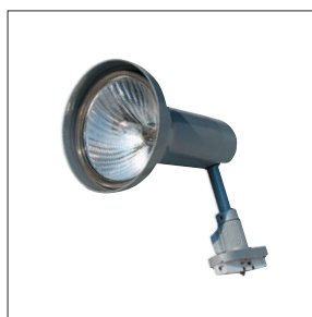
Spot halogen SY STAR 100W EUR 21.00 Cod 019.010.185.000