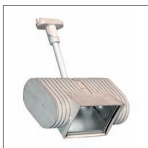
Reflector halogen SYMA STAR 300W EUR 45.00 Cod 019.010.200.006