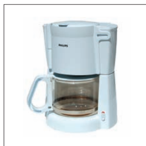
Filtru de cafea EUR 6.00 Cod 025.010.120.010