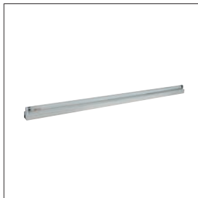
Lampa fluorescenta FIA EUR 18.00 cu instalatie electrica completa 1x40W Cod 019.010.110.000