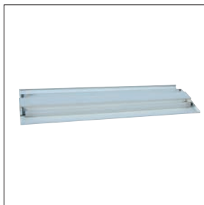
Corp fluorescent tip EUR 26.00 OCTANORM cu doua tuburi D-171 Cod 019.010.200.000