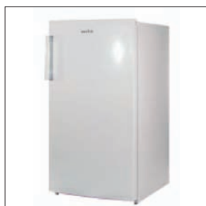
Frigider ARCTIC FB 155 EUR 31.00 Cod 025 010 020 198