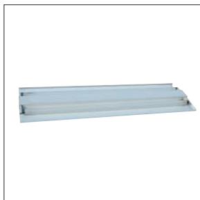
Corp fluorescent tip EUR 23.00 OCTANORM cu doua tuburi D-171 Cod 019.010.200.000