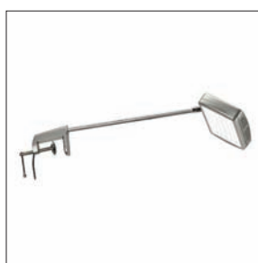
Reflector tija LED A++ 16W 1100LM 4000K ARM33CM EUR 45.00 Cod 019.010.200.040