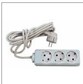
Prelungitor 230V, 10A, 3m EUR 15.00 Cod 019.010.277.000