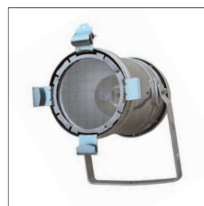
Reflector HIGHLITE HQI 150W EUR 45.00 Cod 019.010.390.000