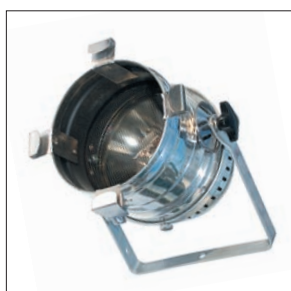
Reflector PAR64 500-1000W EUR 50.00 Cod 019.010.200.020