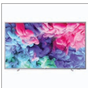
TV LED SMART 4K, EUR 45.00/zi UHD ultrasubtire (diagonala ecran: 126 cm) Cod 025 010 130 045