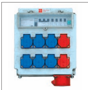
Panou Electric EUR 140.00 OCTANORM Cod 019.010.275.000