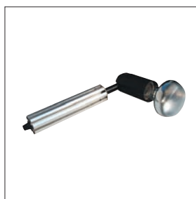
Lampa spot stut OCTANORM EUR 18.00 Cod 019.010.187.000