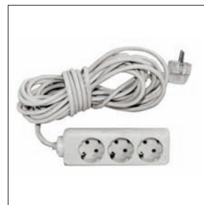
Prelungitor 230V, 10A, 5m EUR 15.00 Cod 019.010.279.000