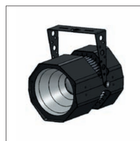
Reflector LED VIRGO EUR 45.00 40W 4350 LM 4100 K Cod 019.010.200.045