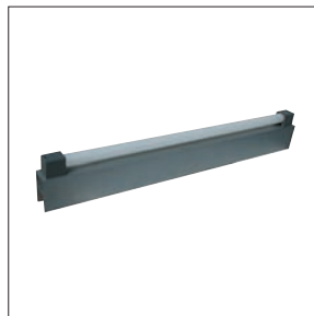
Corp fluorescent tip SS30 EUR 18.00 cu un tub D-170 Cod 019.010.190.000