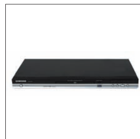
DVD Player EUR 45.00 Cod 025 010 130 030