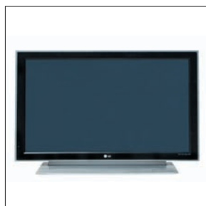
TV Plasma EUR 28.00/zi (diagonala ecran: 107 cm) Cod 025 010 130 040