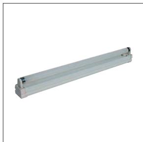
Corp fluorescent tip SS30 EUR 21.00 cu un tub D-170 - A Cod 019.010.190.001