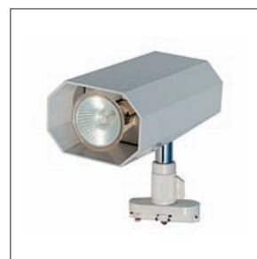
Spot halogen SY STAR 50W(A) EUR 21.00 Cod 019.010.186.000