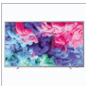
TV LED SMART 4K, EUR 50.00/zi UHD ultrasubtire (diagonala ecran: 126 cm) Cod 025 010 130 045