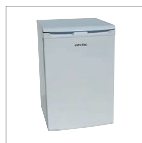
Racitor (140 l) EUR 31.00 Cod 025 010 070 010 (55 x 61 x 84 cm)