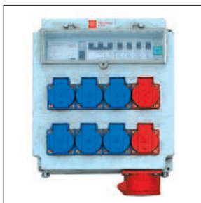
Panou Electric EUR 130.00 OCTANORM Cod 019.010.275.000