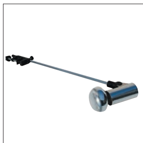
Lampa spot cu brat EUR 15.00 Cod 019.010.180.000