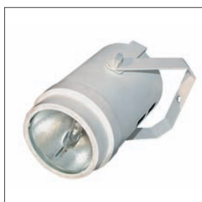
Reflector HQI 80W EUR 45.00 Cod 019.010.200.030